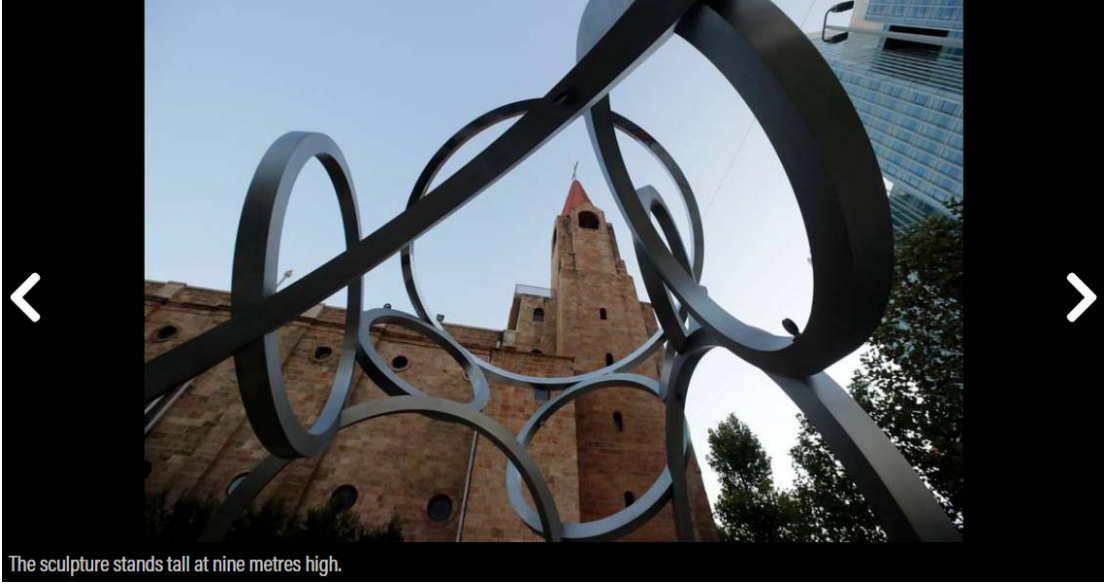
The sculpture stands tall at nine metres high.