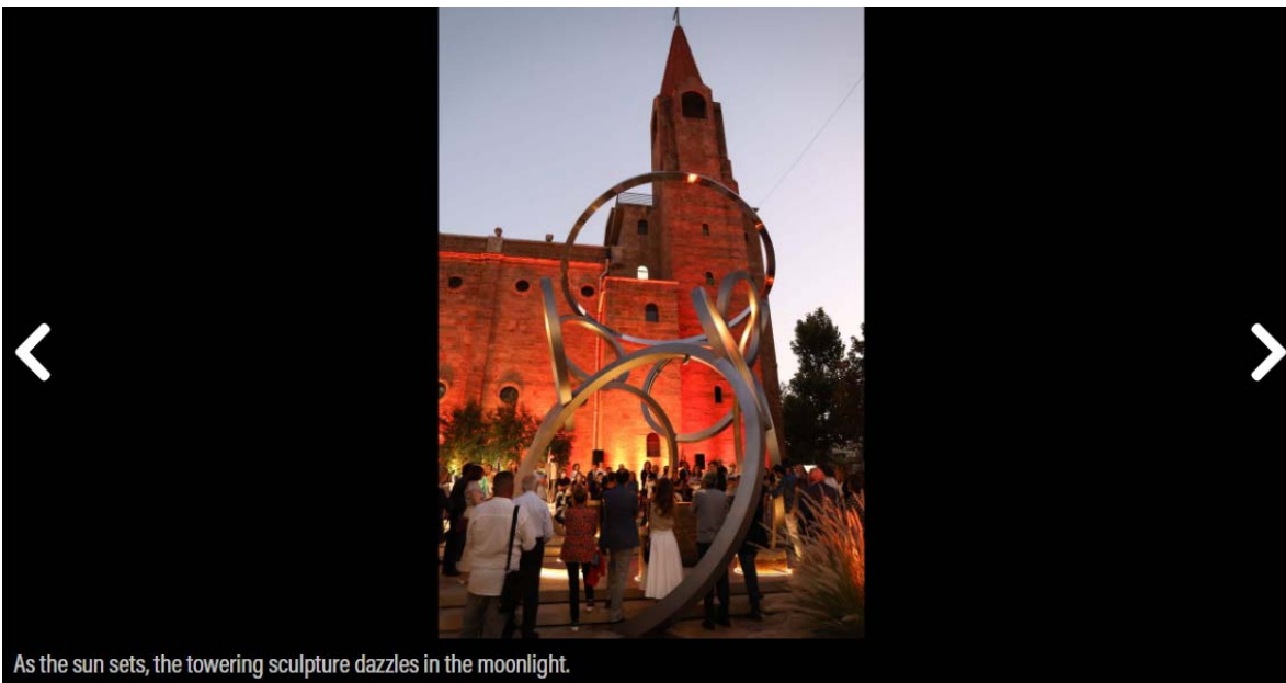
As the sun sets, the towering sculpture dazzles in the moonlight.