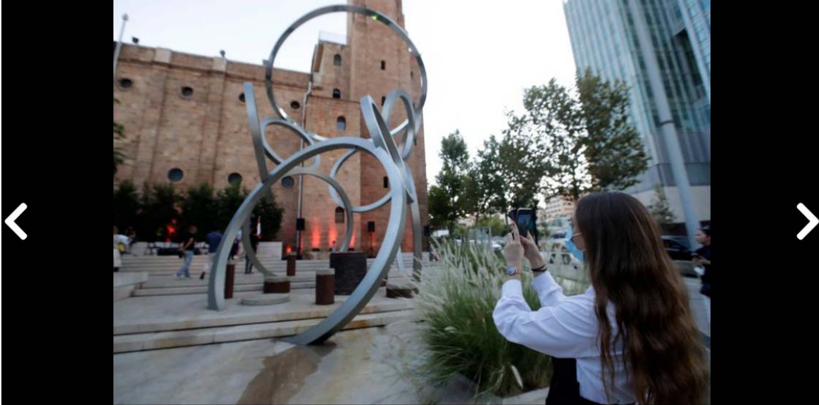
A woman photographs a sculpture by Lebanese artist Nayla Romanos Iliya, entitled 'On the Other Side of Time', a permanent artwork erected in front of the church of St Elias in Beirut.