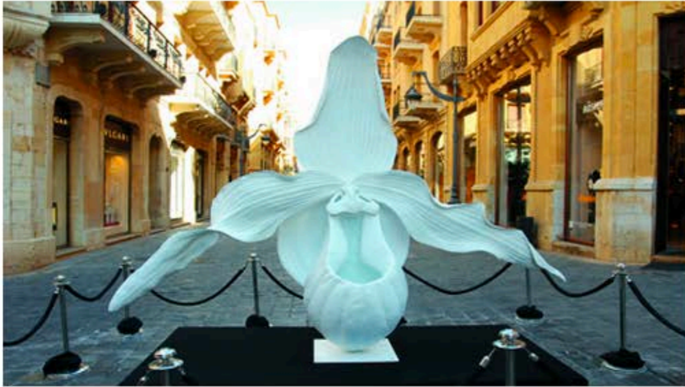
«The Chromatic Archeology of Desire», bronze sculpture by Marc Quinn, Moutran street.